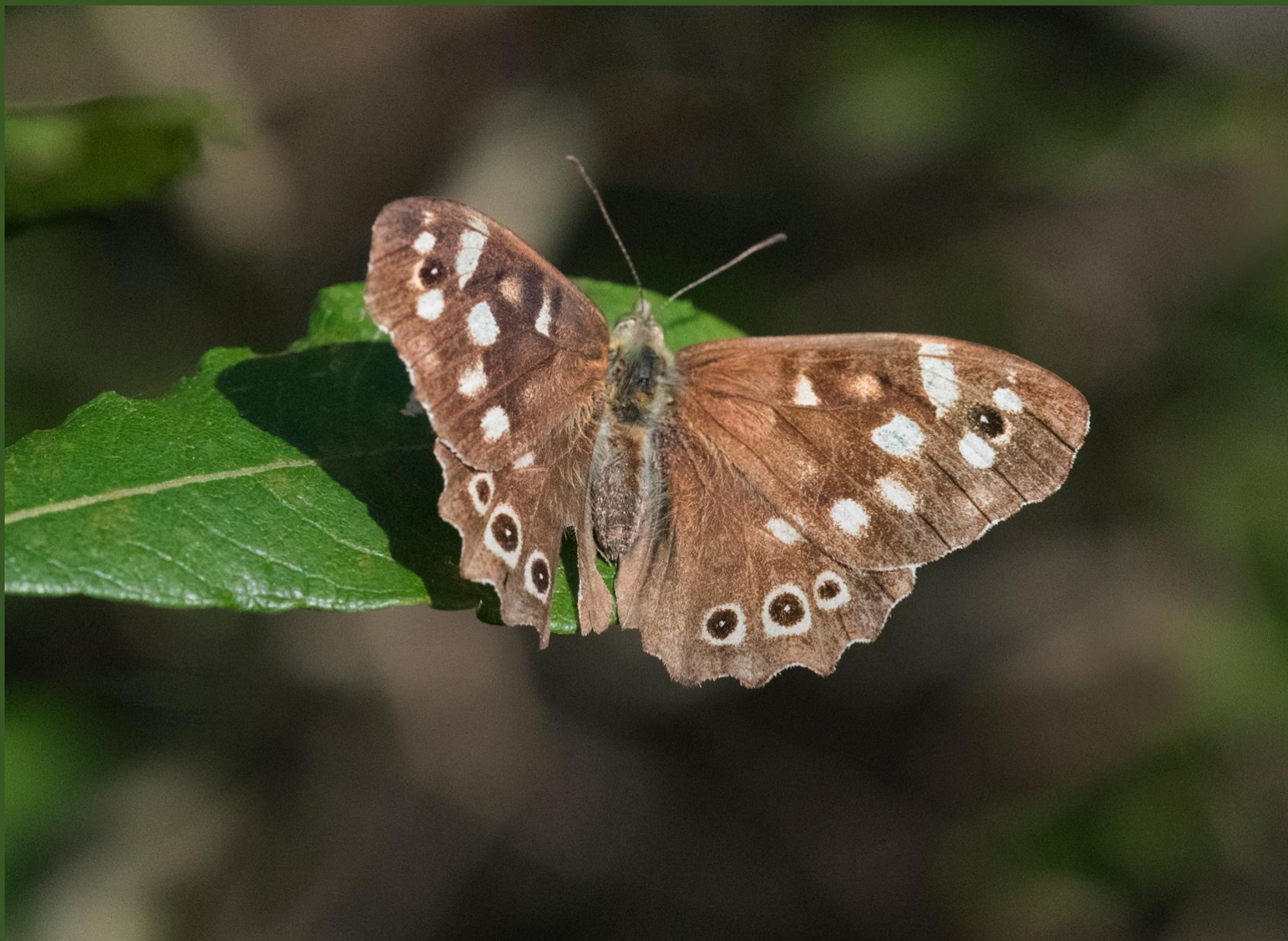
Speckled Wood, one of the last of the year. 11 th October