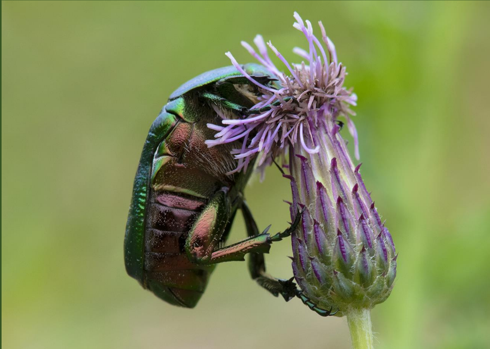
The Rose Chafer ( Cetonia aurata )