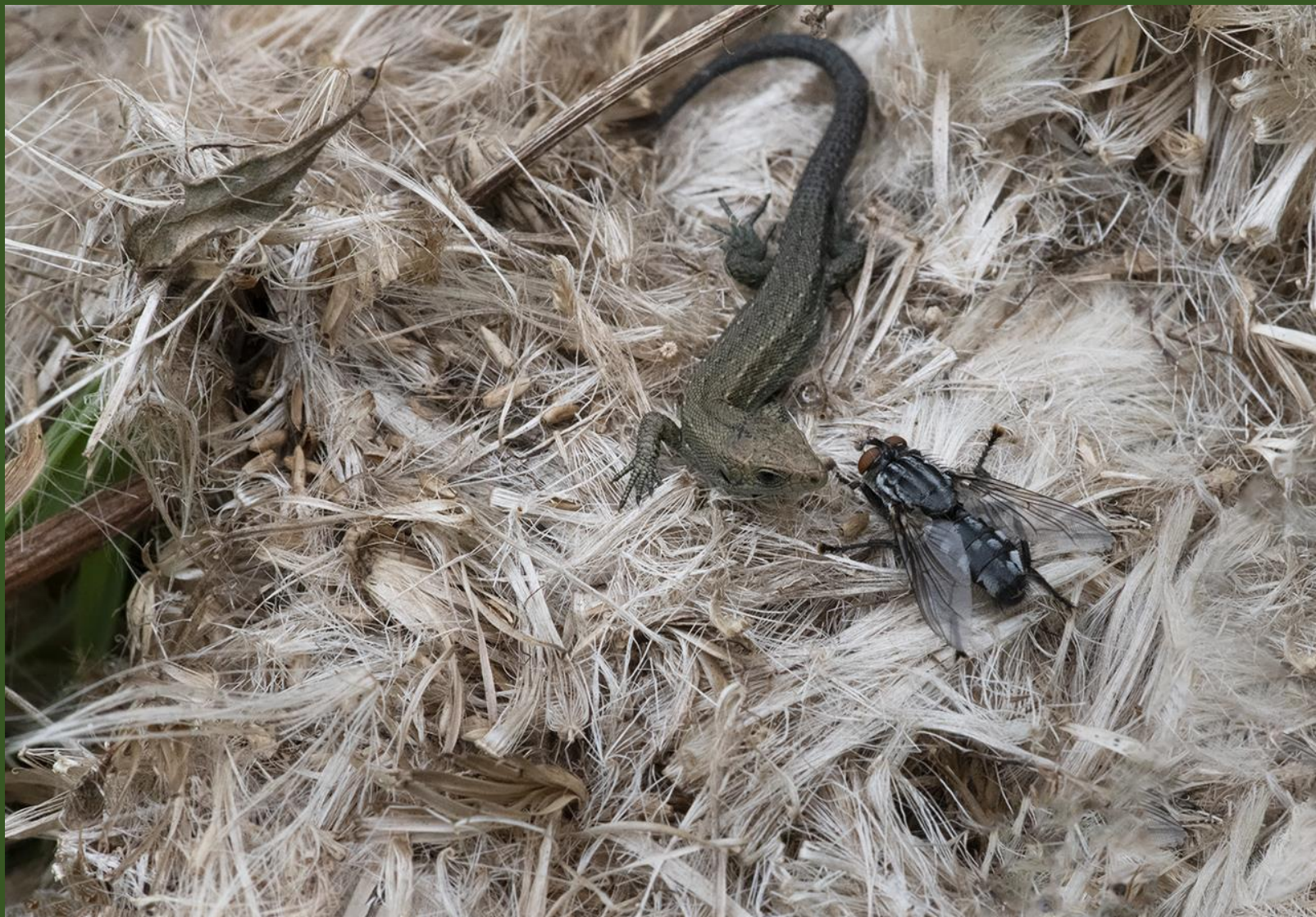
Common lizard and a flesh fly on a bed of thistle seeds.