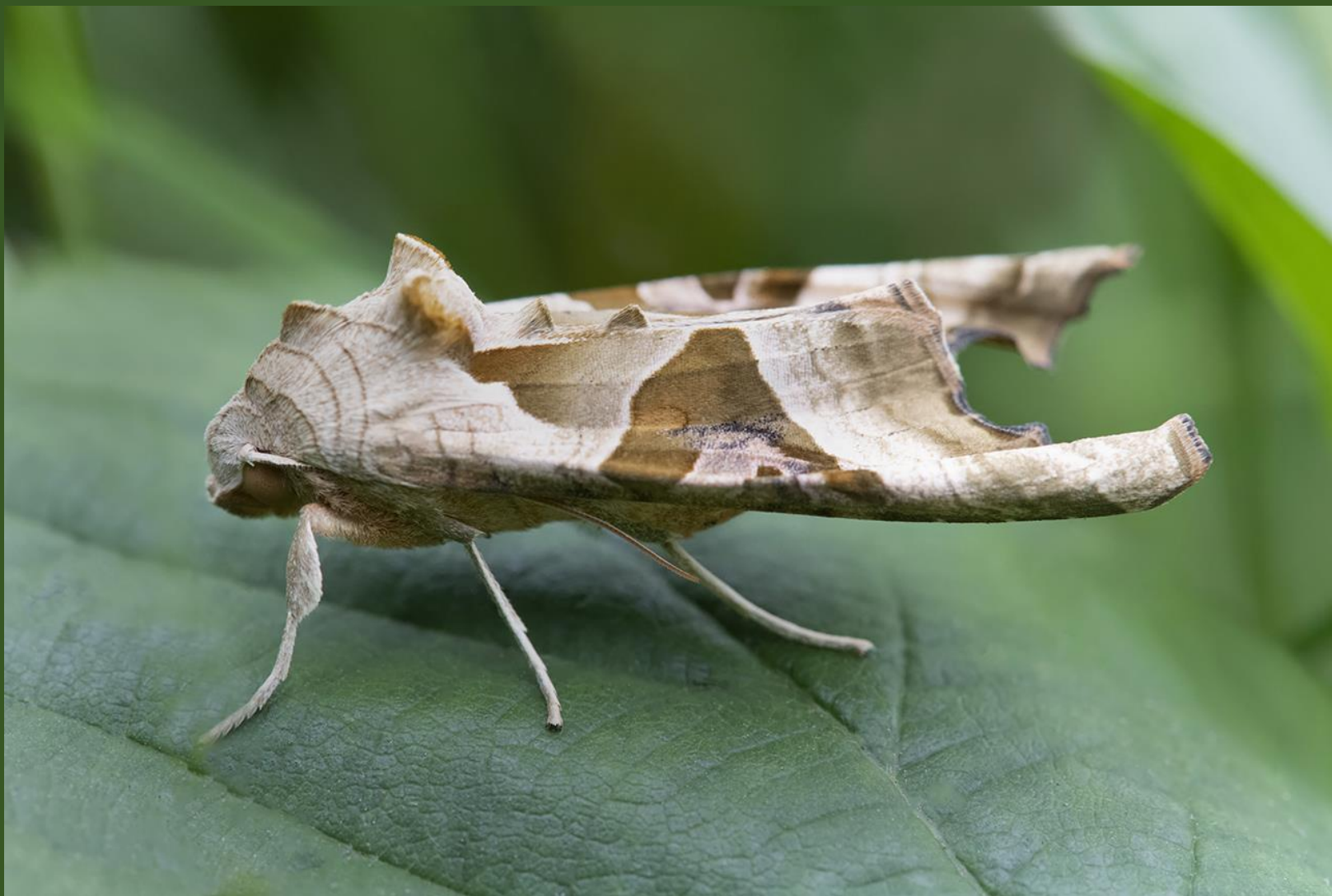
Angle Shades moth roosting ( Phlogophora meticulosa ).