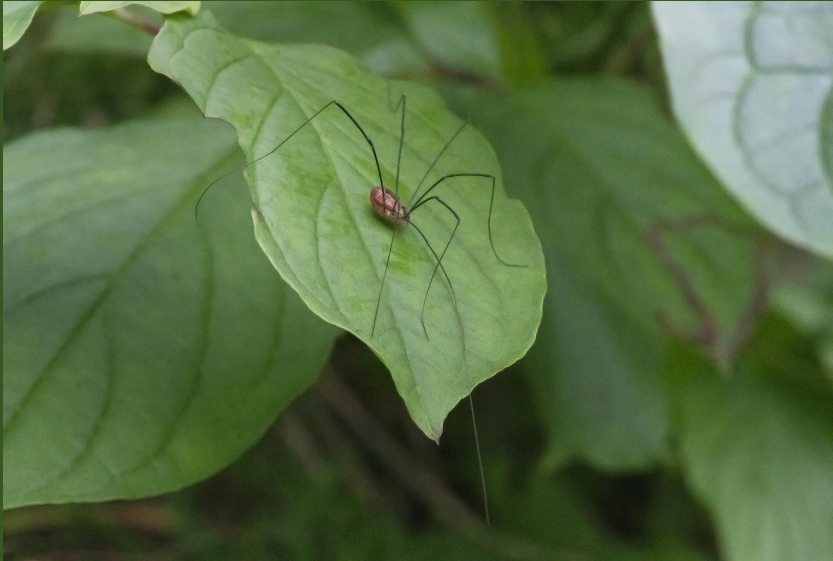
Harvestman ( Leiobunum rotundum ).

Harvestmen do not fly and unlike spiders which have up to eight eyes, harvestmen only have two. They are often confused as craneflies ( daddy long legs) which can of course fly.