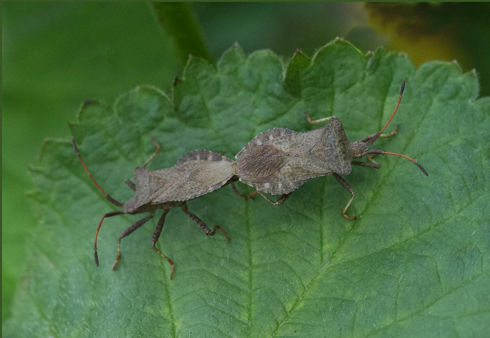
Dock bugs pairing. ( Coreus marginatus ).