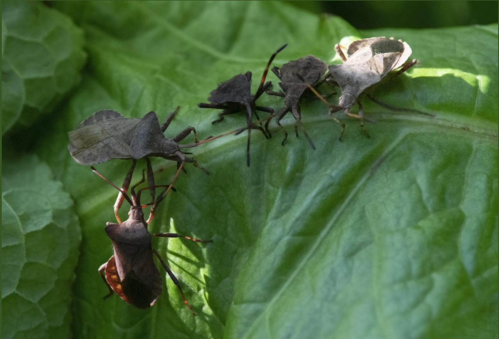
Dock bugs ( Coreus marginatus ).