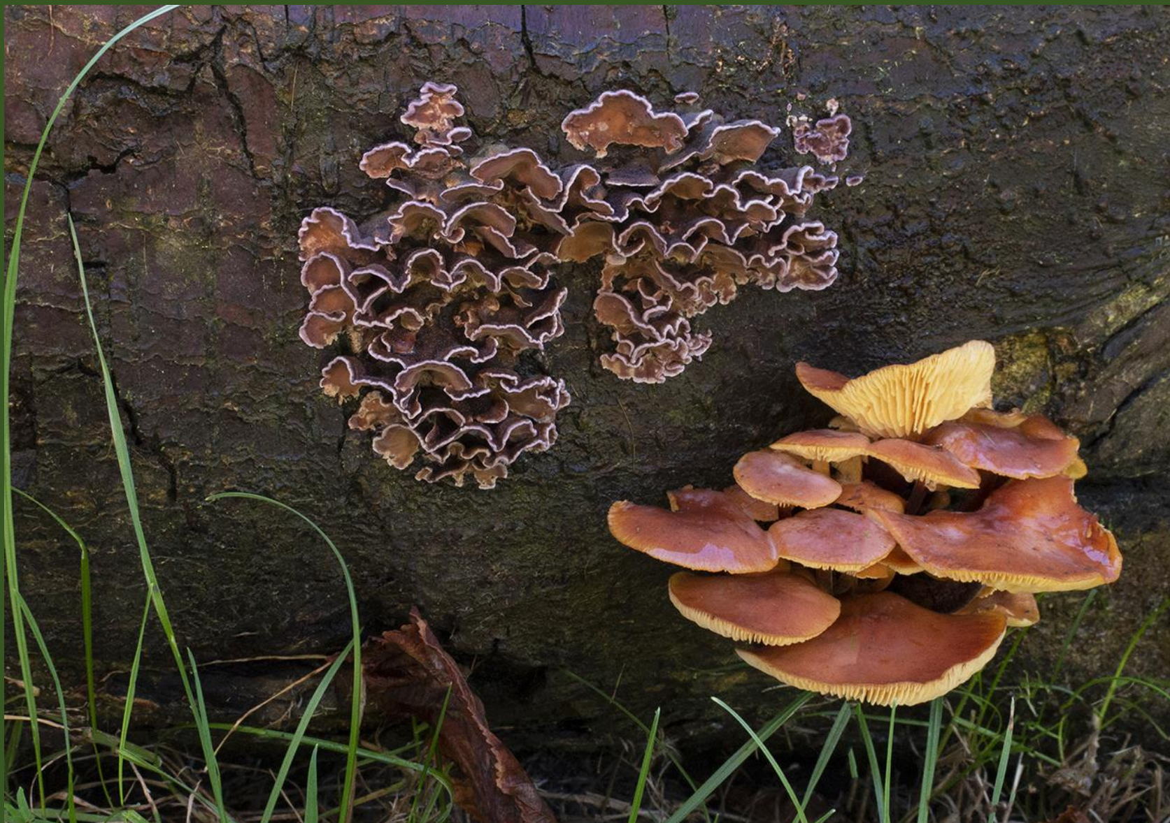
Silverleaf fungus ( Chondrostereum purpureum ) - Enoki ( Flammulina )