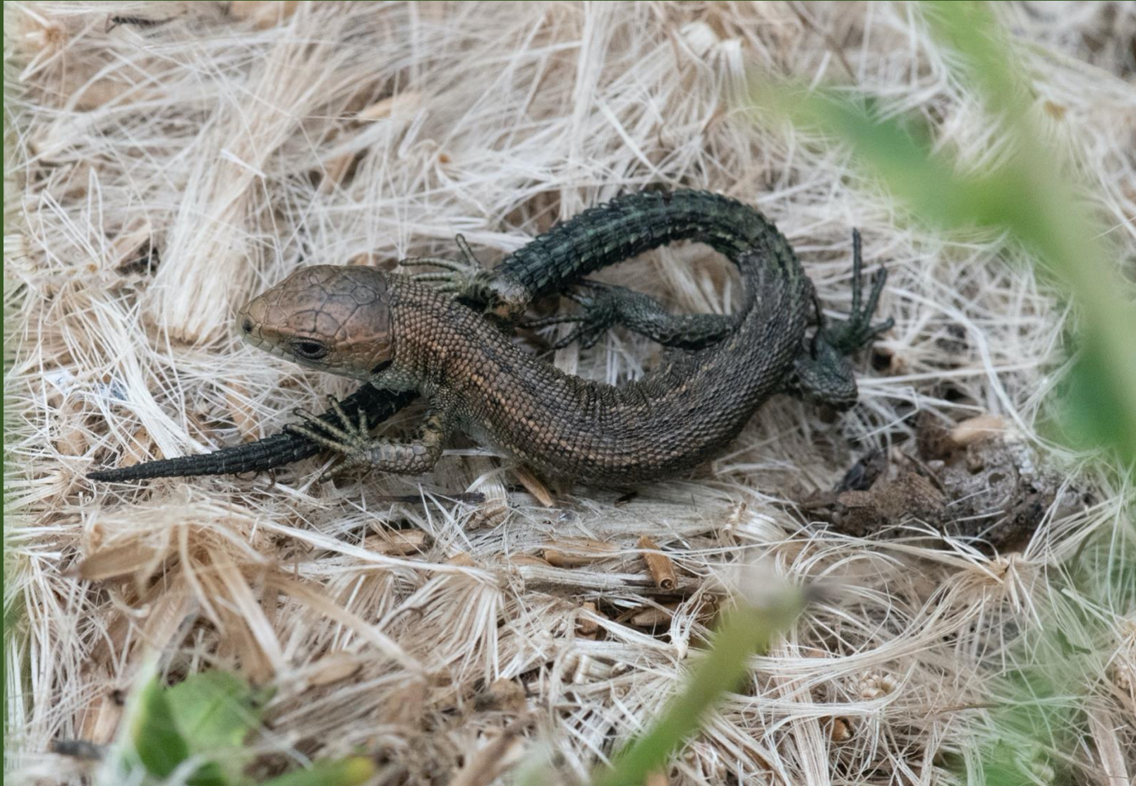
Common lizard (juvenile) on a bed of thistle seeds.