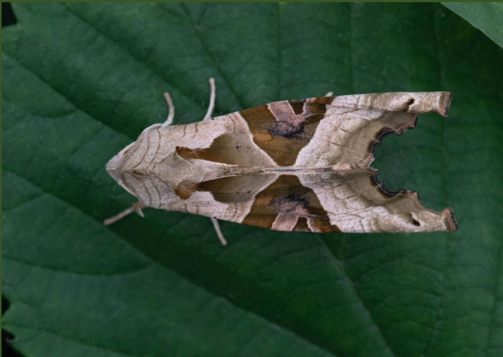
Angle Shades moth roosting ( Phlogophora meticulosa ).