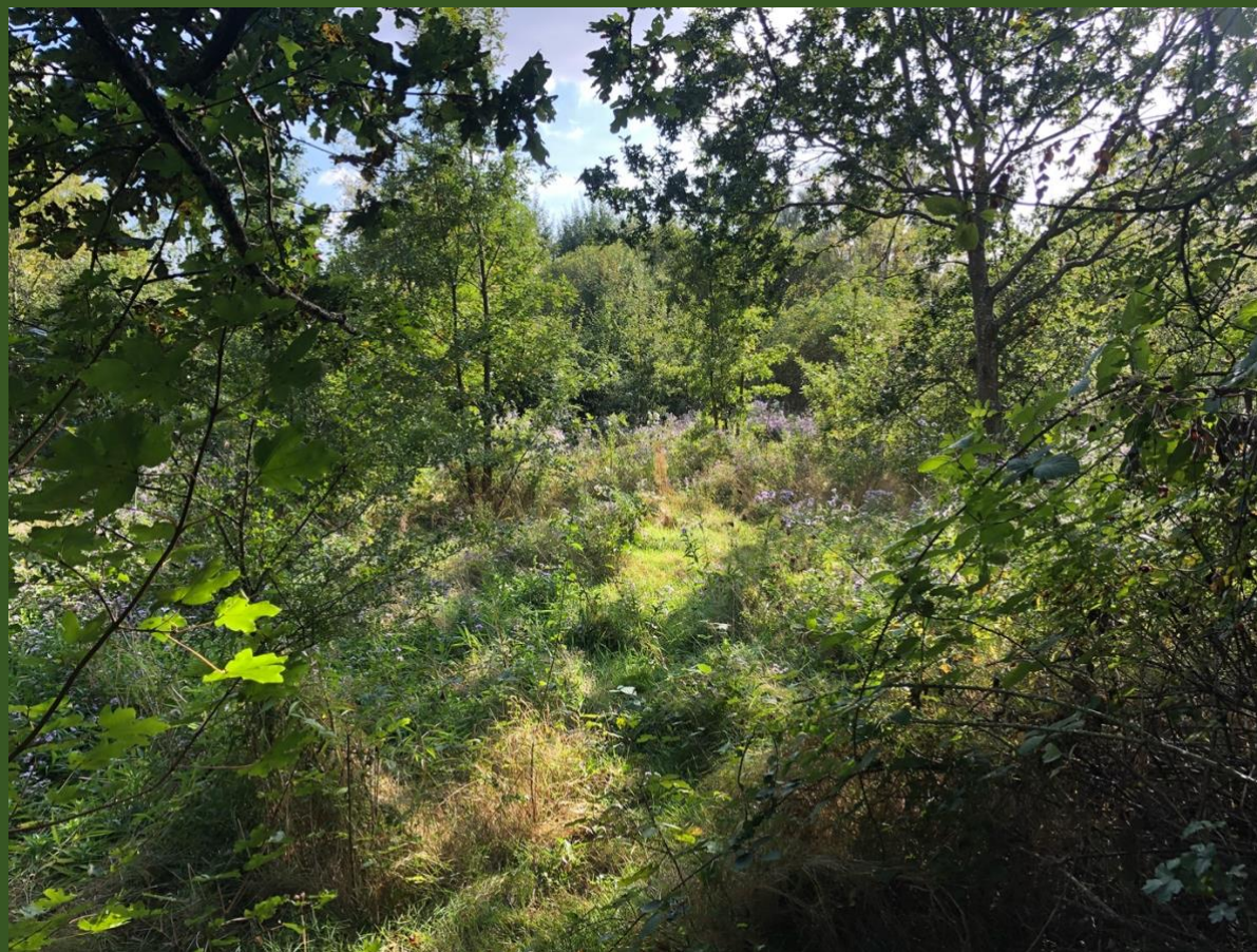
Photographs from ‘Scrubs’ and Little Scrubs in West London.