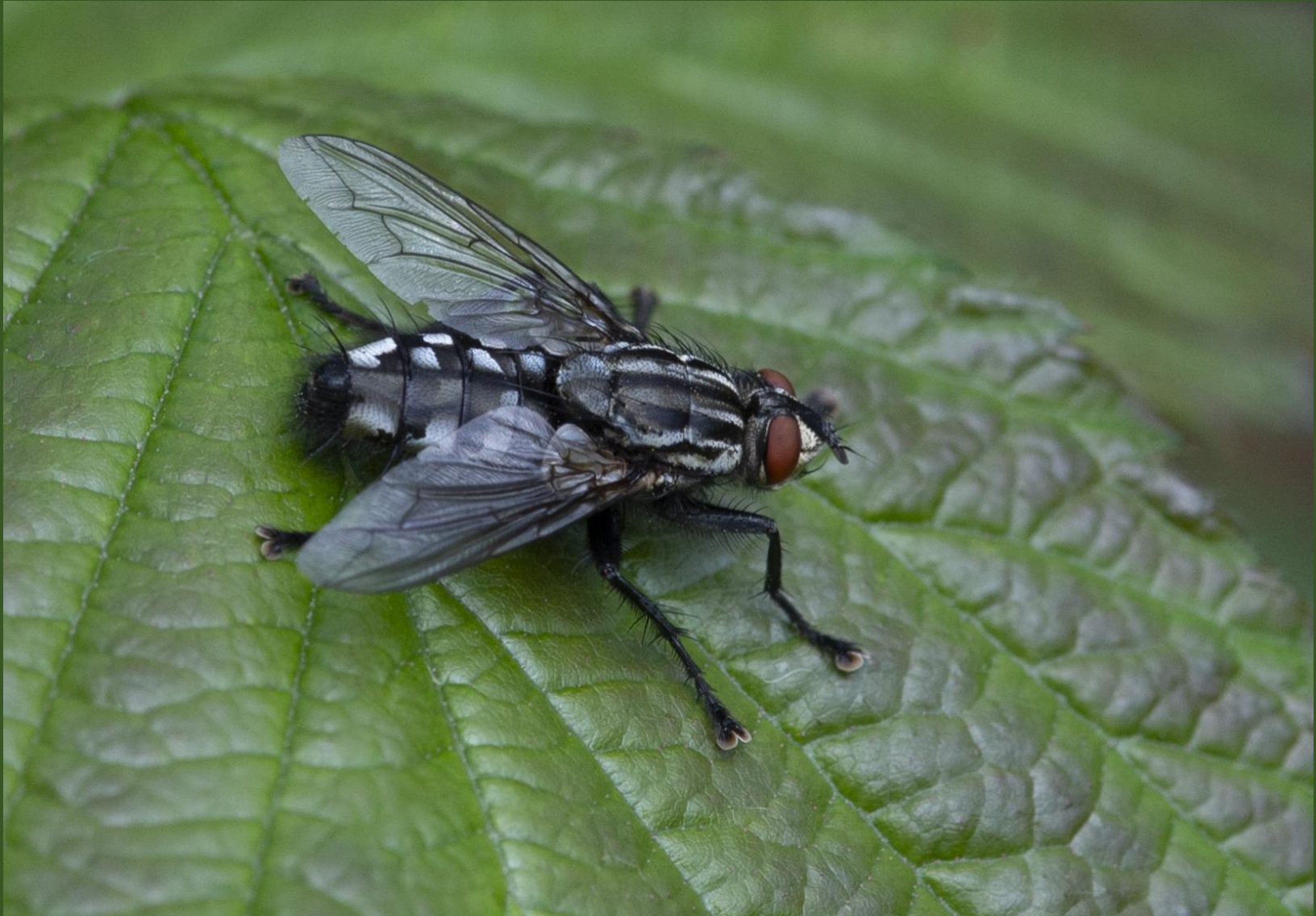
Flesh fly ( Sarcophaga camaria ).