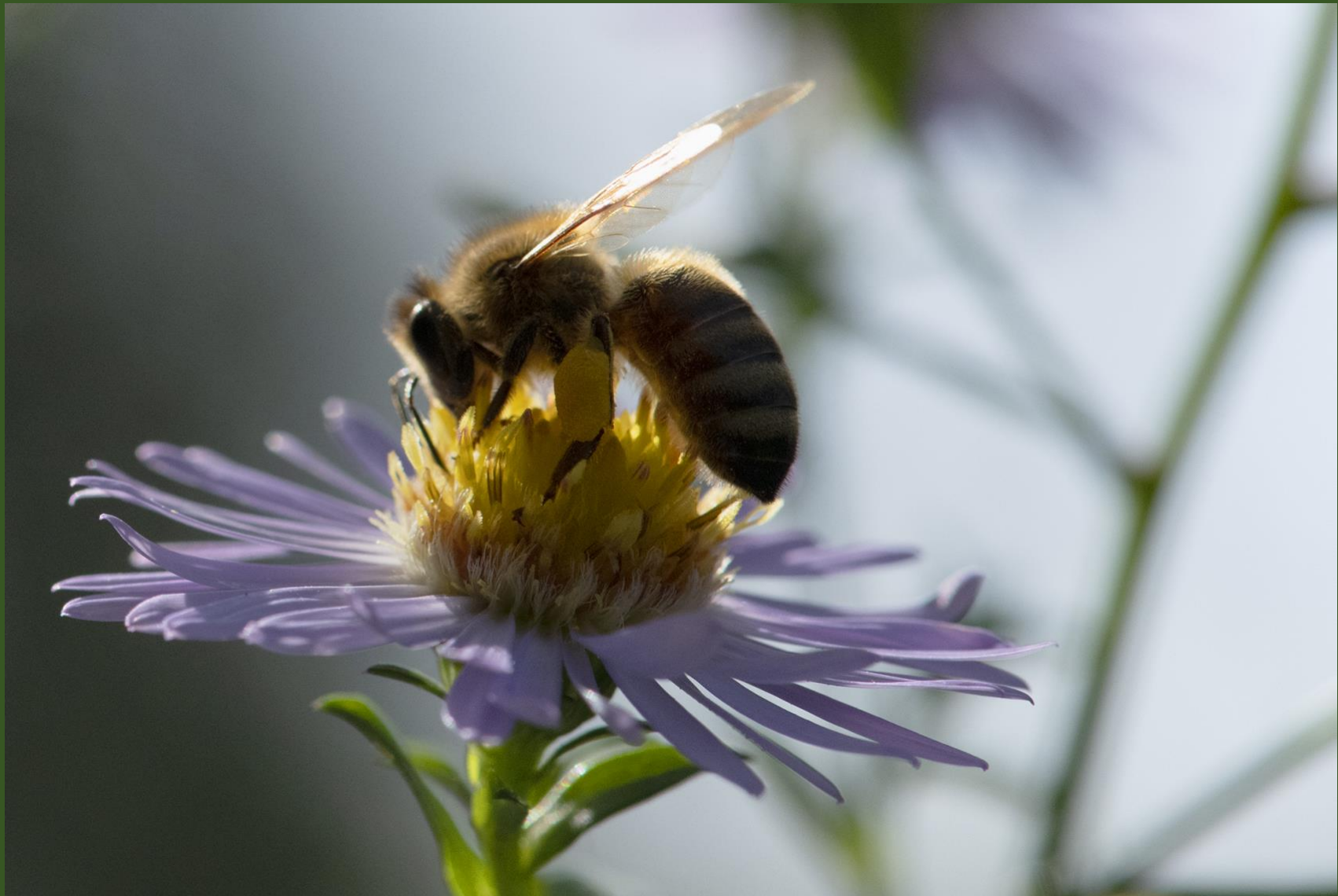
Western honey bee nectaring on a Michaelmas daisy ( Apis mellifera ).