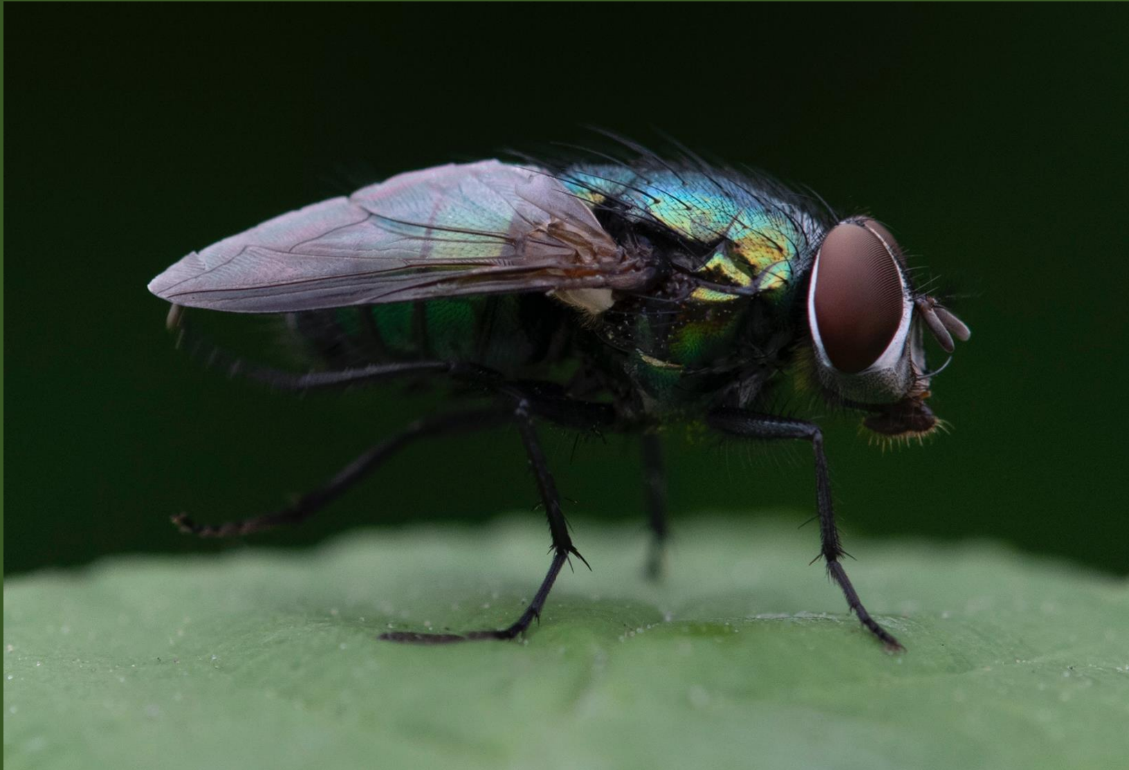
Common green bottle fly ( Lucilia sericata ).