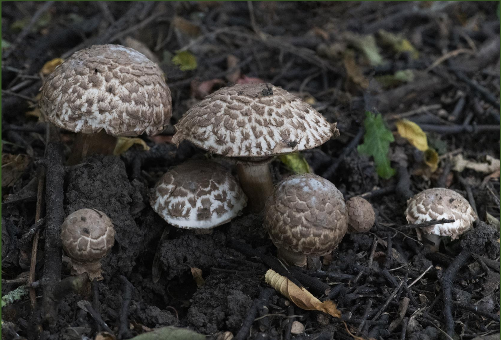
Medusa mushrooms ( Agaricus bohusii )