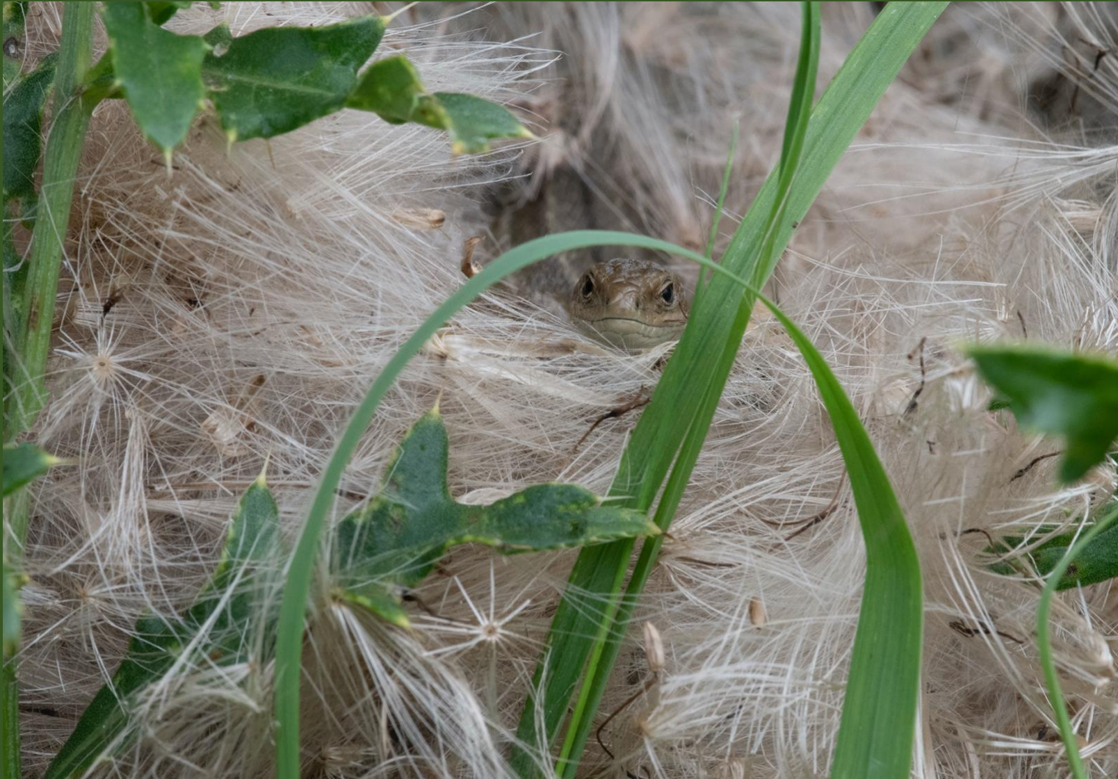
Common lizard (adult) in a bed of thistle seeds.