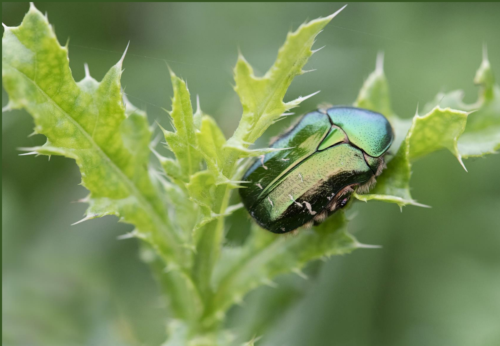
The Rose Chafer ( Cetonia aurata ) roosting.