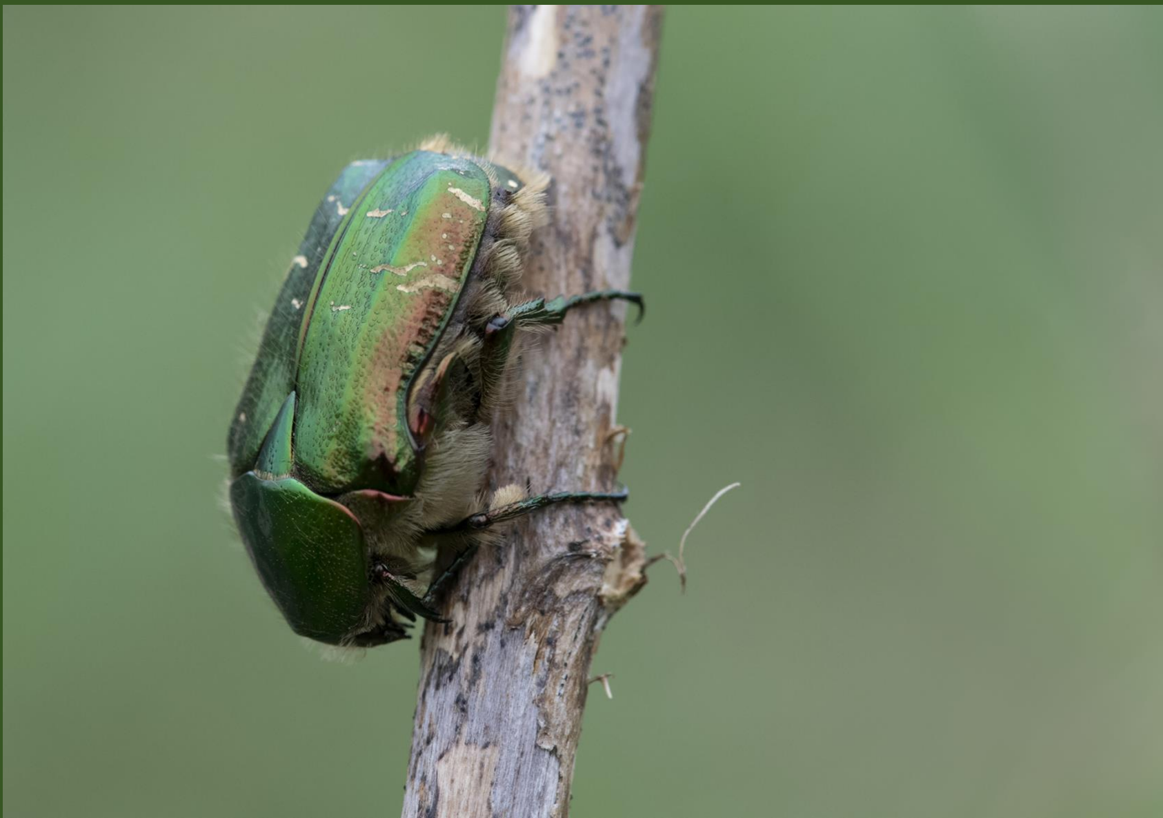
The Rose Chafer ( Cetonia aurata ) roosting.