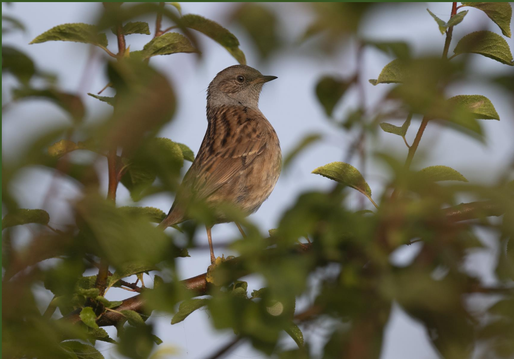
Dunnock ( Prunella modularis )