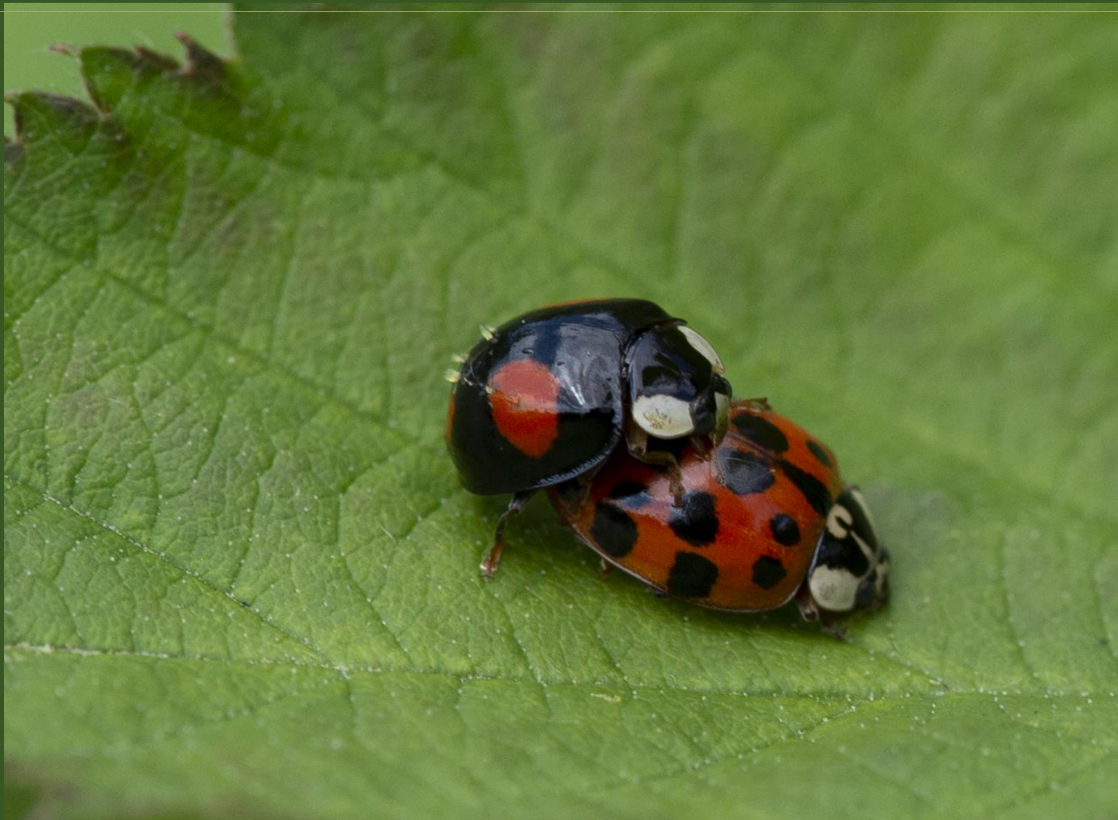
Harlequin ladybirds pairing. ( Harmonia axyridis )