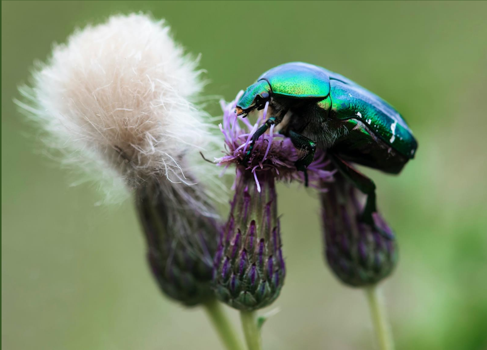
The Rose Chafer ( Cetonia aurata ) feeding on a Creeping thistle.