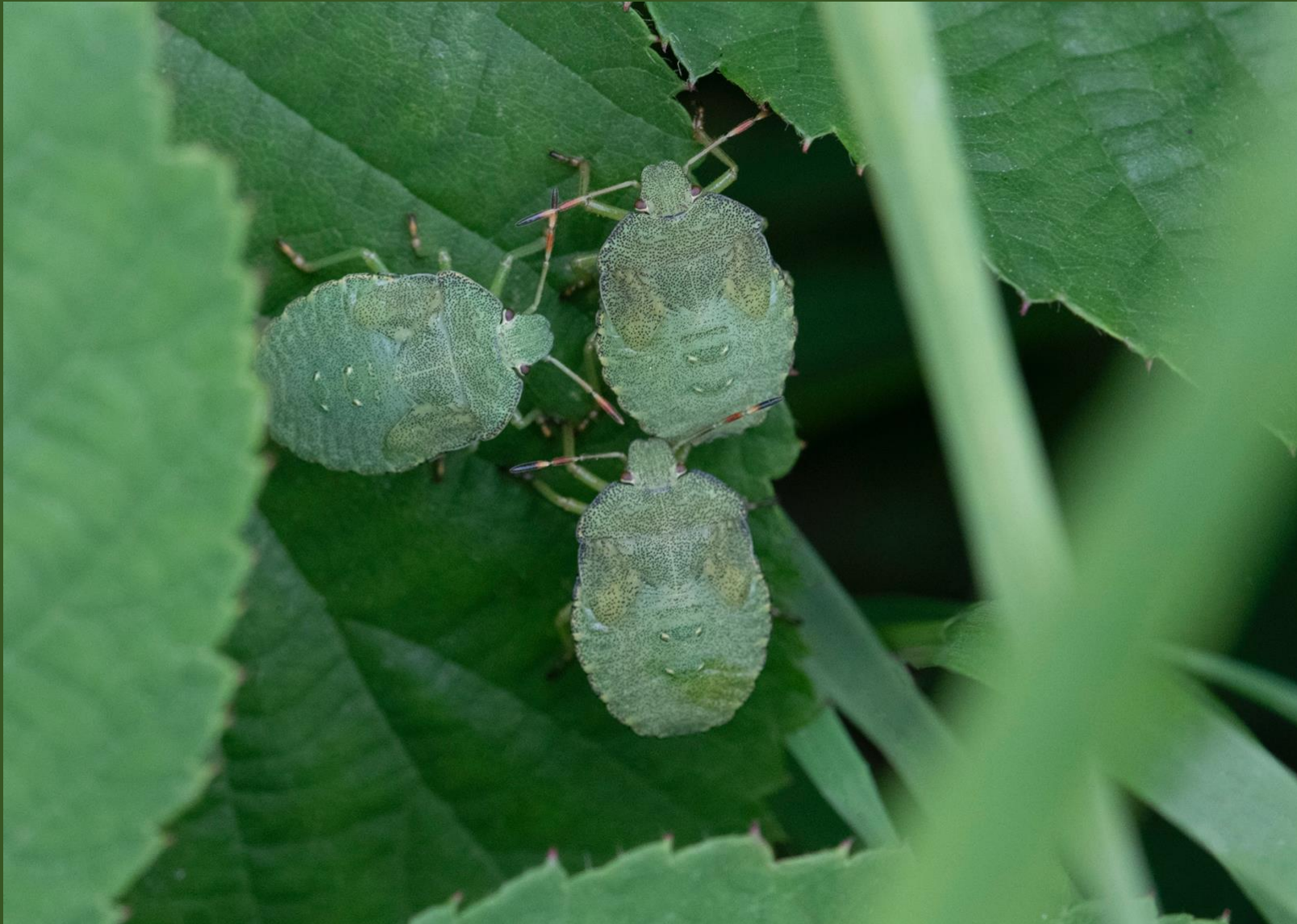
Green shield bugs ( Palomena prasina ).