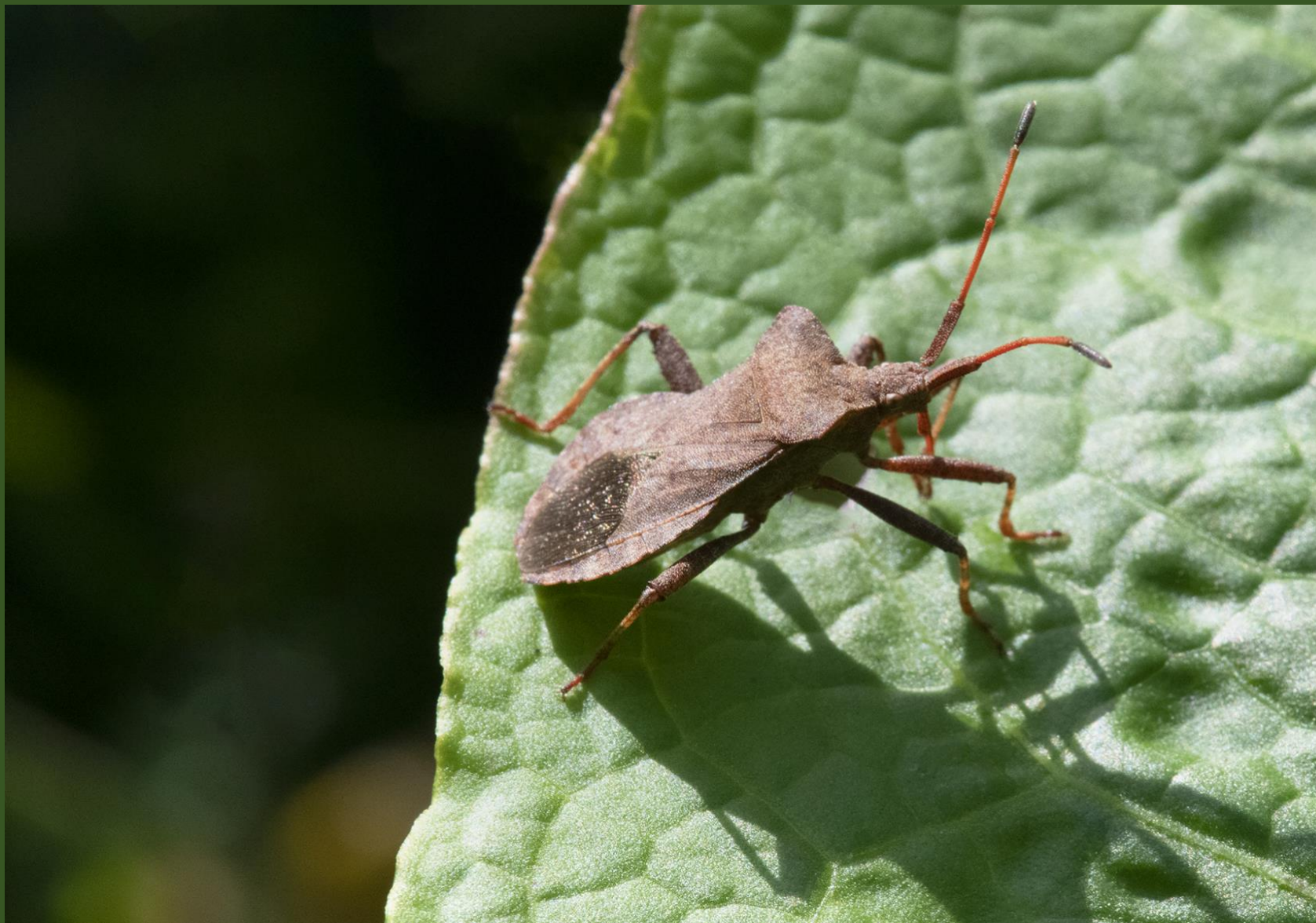
Dock bug ( Coreus marginatus ).