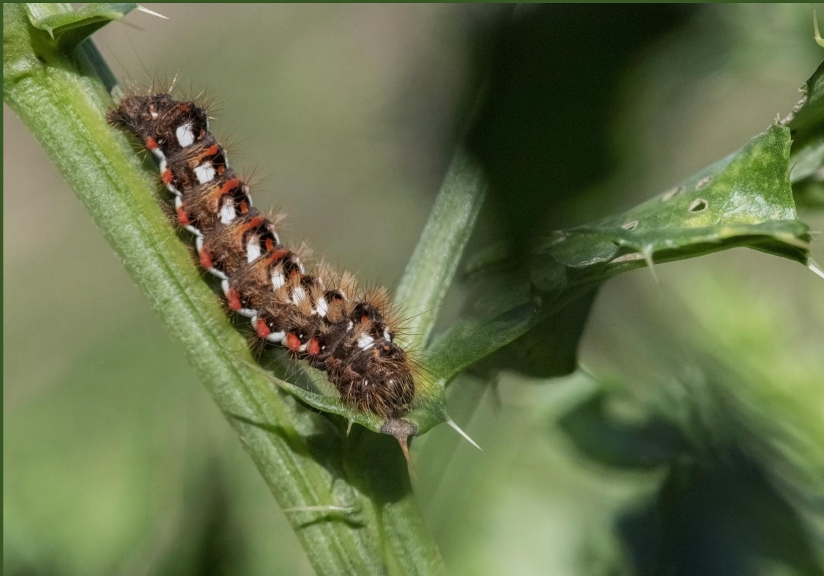
Knot Grass moth larva.