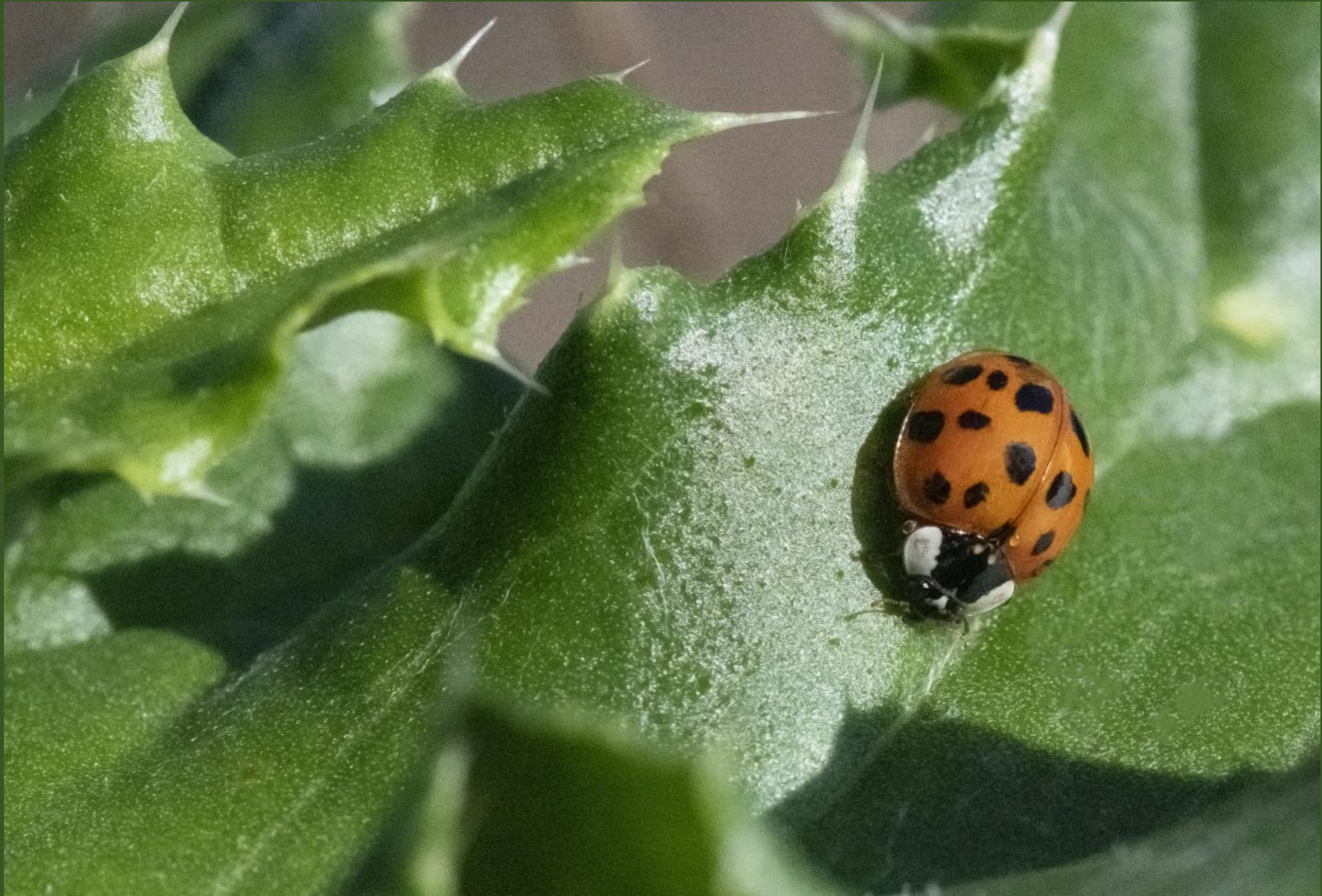
Harlequin ladybird ( Harmonia axyridis )

A non-native beetle introduced to Britain in 2004.